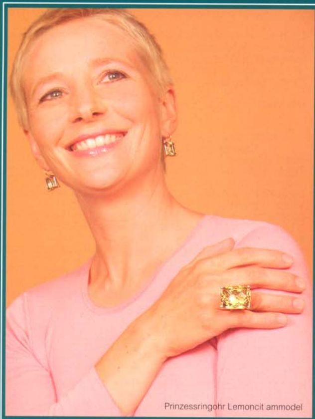
Prinzessringohr Lemoncit ammodell

"Hollywood" ring is how Erich Zimmermann christened his latest jewelry creation, expressing what an uncompromising and discrimination designer and craftsman thinks about glamour: By no means should it be merely superficial glitter as the result of cheap showmanship but instead should be genuine and unforgettable splendor. No less than the real thing. Just like the elegance of those great divas of the silver screen whose movies we can watch countless times and who, up to the present day, have outdone many stars and starlets with superior ease.