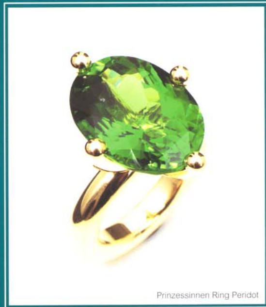
Prinzessinnen Ring Peridot

Each of the six prongs, which encircle the deep-blue topaz of the "Hollywood" ring like a crown, is topped with a small champagne-colored diamond – a worthy setting for a royal stone. The great novelty of this ring is its band. In the past, the ring bands in Zimmermann's creations used to be distinctly unobtrusive in order to place the stone in the center of attention. The "Hollywood" ring now features a wider band which is a