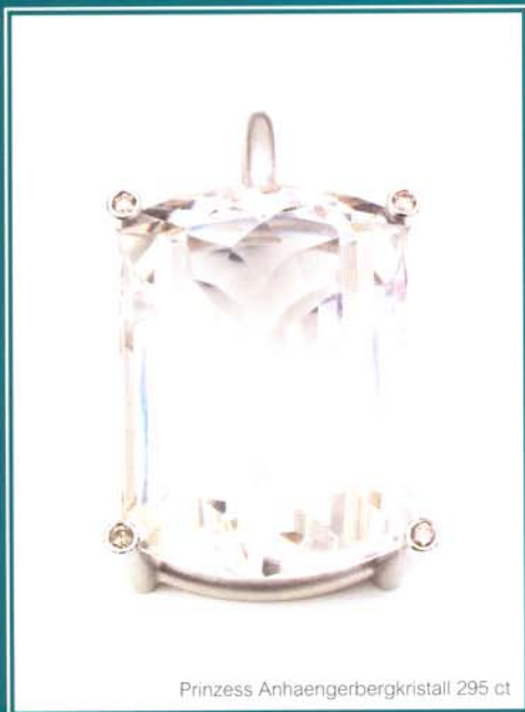
Prinzess Anhaengerbergkristall 295 ct

showpiece in itself: richly beset with champagne-colored brilliant-cut diamonds that enter into a subtle and noble interplay of colors with the white gold.