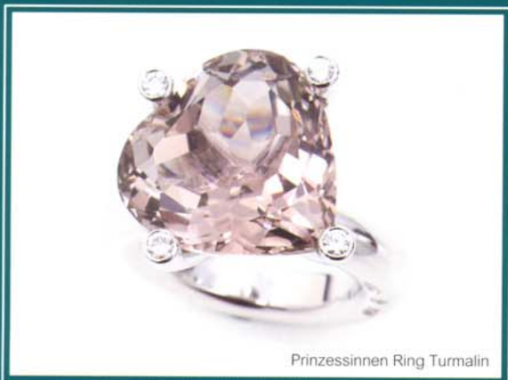
Prinzessinnen Ring Turmalin

What would divas of such class as Ava Gardner or Grace Kelly long for today if they could once again grace the screen as the most legendary jewel thieves in film history?